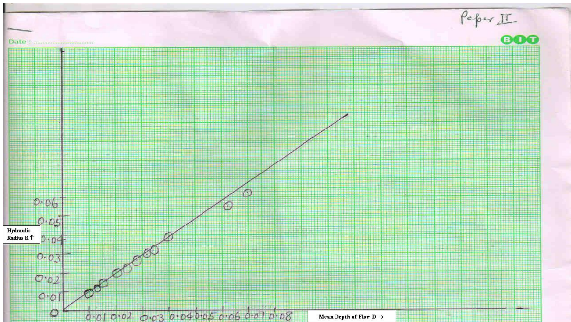
Figure 1: Variation of Parameter Hydraulic Radius with Mean Depth of Flow for 0.5 Inch Roughness Bed

Increase in depth is due to roughness of the channel bed whereas hydraulic radius is associated with free surface.