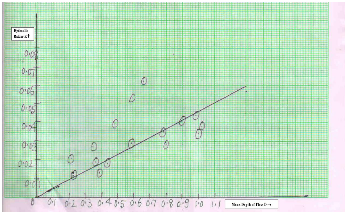
Figure 4: Variation of Hydraulic Radius with Mean Depth Velocity of Flow for 0.75 Inch Roughness Bed

Figure 1: As mean depth of flow increases hydraulic radius increases because hydraulic radius depends upon mean depth of flow. Hydraulic radius is the depth of flow taken from the channel bottom to a point where velocity is half of the maximum velocity.